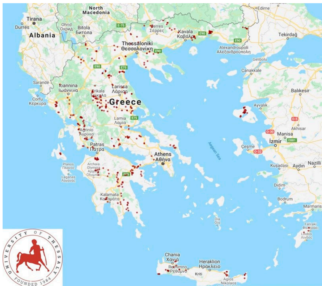
Figure 1. Location of 444 small ruminant farms around Greece, which were visited during a country-wide study for interview of farmers regarding zoonotic problems.

were responsible for their decisions and actions in relation to the health and welfare of the animals therein, in full accord with the relevant veterinary conduct codes [16,17]. Visits had been scheduled to 446 farms, but on two occasions, whilst the investigators and the accompanying veterinarians had already arrived at these farms, the respective farmers refused to collaborate (both mentioned that they did not have enough time available to receive a visit). The principal investigators (authors D.T.L. and G.C.F.) visited all the selected farms.