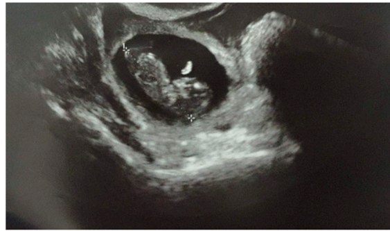
Figure 1. Ultrasound examination demonstrating a 10 + 4 weeks' tubal pregnancy with a fetal heartbeat.

Due to the clinical course, the gestational age, and the size of the ectopic pregnancy, it was decided to take a surgical approach. The laparoscopic evaluation showed 700 mL of hemoperitoneum and an intact but swollen and bleeding right tuba, on the verge of breaking at the level of the ampulla (Figure 2). Right salpingectomy was performed, and the specimen removed was sent for histological examination. The exam confirmed the diagnosis of ectopic pregnancy with embryonic residues and chorionic villi compatible with the first trimester of pregnancy.