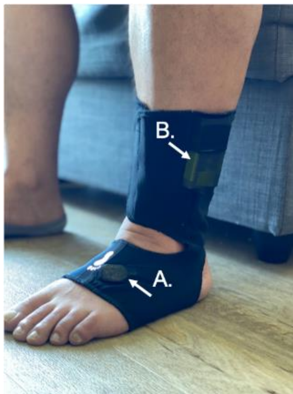
Figure 1. Participant wearing an instrumented sock, APDM prototype. The inertial sensor is located on top of the foot (A), and the main unit containing the battery in the socks is located in a second pocket just above the lateral malleolus (B). To maximize fit, the socks come in different sizes, and the Velcro attachment around the foot and ankle is adjustable to ensure a snug fit and that the sensor does not move on the foot while being worn.

During a baseline visit to the clinic, participants learned how to wear the instrumented socks on each foot and one Opal sensor over the lower lumbar area with an elastic belt for continuous monitoring of mobility. They were instructed to wear the sensors for at least 8 h/day and then take them off to charge each night for a week. Raw data were stored in the 8 GB internal memory of the sensors and uploaded to a secure cloud-based database server for analysis after being mailed back to investigators.