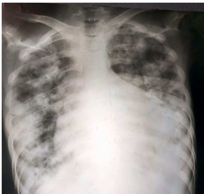
Fig. 1. Chest X ray shows multiple well-defined opacities with cavities in some of them and increased cardiothoracic-ratio.

Postoperatively, the patient was followed up for two weeks with improvement in symptoms and no recurrence manifestations.