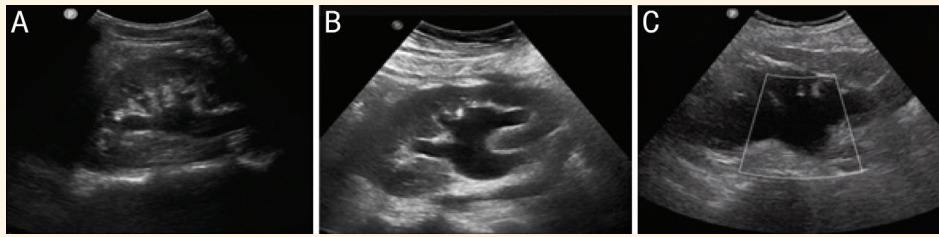
Figure 1: Grading hydronephrosis severity using point-of-care ultrasound as (A) mild, (B) moderate and (C) severe.