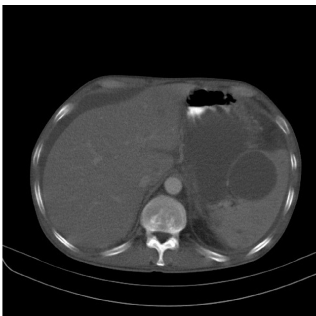
Fig. 4 – Ascitis, free intra peritoneal fluid.

To best of our knowledge, several extra-pulmonary Pneumocystis cases have been reported in which mostly aerosolized