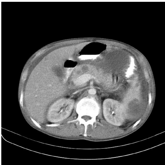
Fig. 3 – Multiple cystic lesions in pancreas.