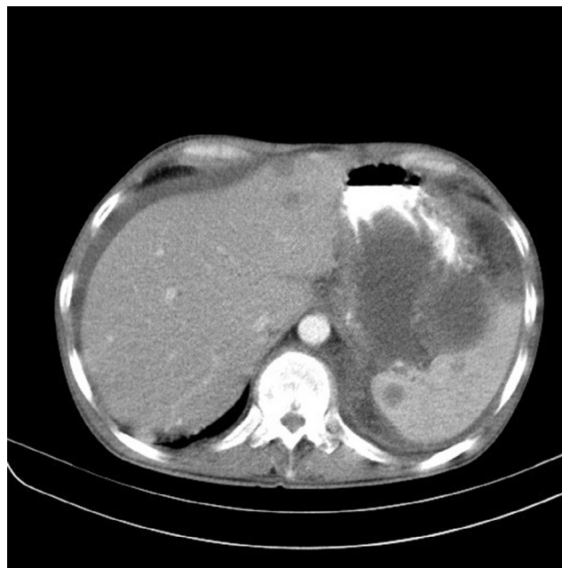
Fig. 1 – Multiple cystic lesions in liver.

like fever, cough, and dyspnea. CXR appearances are mostly seen as bilateral diffuse symmetric finely granular/reticular interstitial/airspace infiltration and most common CT features are patchy work pattern (56%), bilateral asymmetric patchy mosaic appearance. 2,3 However, negative CT does not rule out the diagnosis. While PCP is the most prevalent severe pulmonary infection in HIV-infected patients, extra-pulmonary pneumocystosis is almost rare. Extra-pulmonary Pneumocystis infection occurs in HIV-infected patients on pentamidine prophylaxis or in advanced HIV infection without prophylaxis, even without pulmonary involvement. It can affect all organs