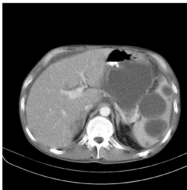
Fig. 2 – Multiple cystic lesions in spleen.

like fever, cough, and dyspnea. CXR appearances are mostly seen as bilateral diffuse symmetric finely granular/reticular interstitial/airspace infiltration and most common CT features are patchy work pattern (56%), bilateral asymmetric patchy mosaic appearance. 2,3 However, negative CT does not rule out the diagnosis. While PCP is the most prevalent severe pulmonary infection in HIV-infected patients, extra-pulmonary pneumocystosis is almost rare. Extra-pulmonary Pneumocystis infection occurs in HIV-infected patients on pentamidine prophylaxis or in advanced HIV infection without prophylaxis, even without pulmonary involvement. It can affect all organs