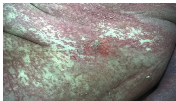
Fig. 2 – Positive Nikolsky sign.