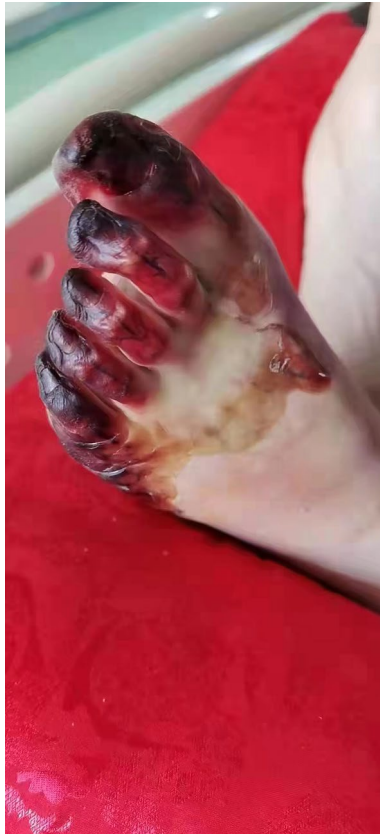
Fig. 2 Tissue blackening gangrene