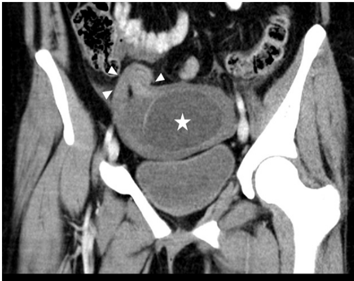
Image 2. Coronal computed tomography of the pelvis shows the 7-centimeter cystic structure (star) within the pelvis with surrounding fluid. Along the right side of the cystic structure there is extension into the location of the area of the right fallopian tube (arrowheads).

Recognition and appropriate management are essential.