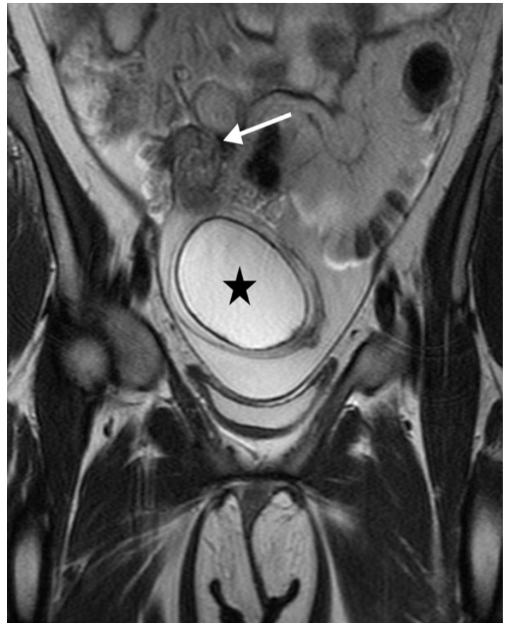
Image 3. Coronal T2 weighted magnetic resonance imaging of the pelvis demonstrates a 7-centimeter fluid signal tubal mass (star) with a twisted appearance of the torted right fallopian tube (arrow).

thickening in the setting of normal-appearing ovaries. 2 Computed tomography and MRI may aid in the diagnosis. On CT, a mass between the uterus and the ovary is a sensitive (97%) and specific (81%) feature in women with adnexal torsion. Still, no consistent characteristic has been described for IFTT. 2 Magnetic resonance imaging is preferable for sparing radiation exposure but may not always be readily available in all EDs. Definitive treatment is