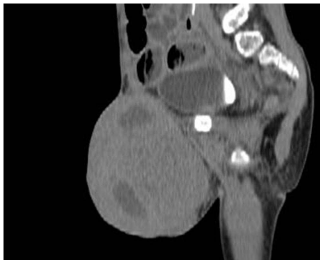
Figure 2 Sagittal reformatted enhanced CT scan of the pelvis showing a heterogeneously enhancing mass occupying the scrotum region.