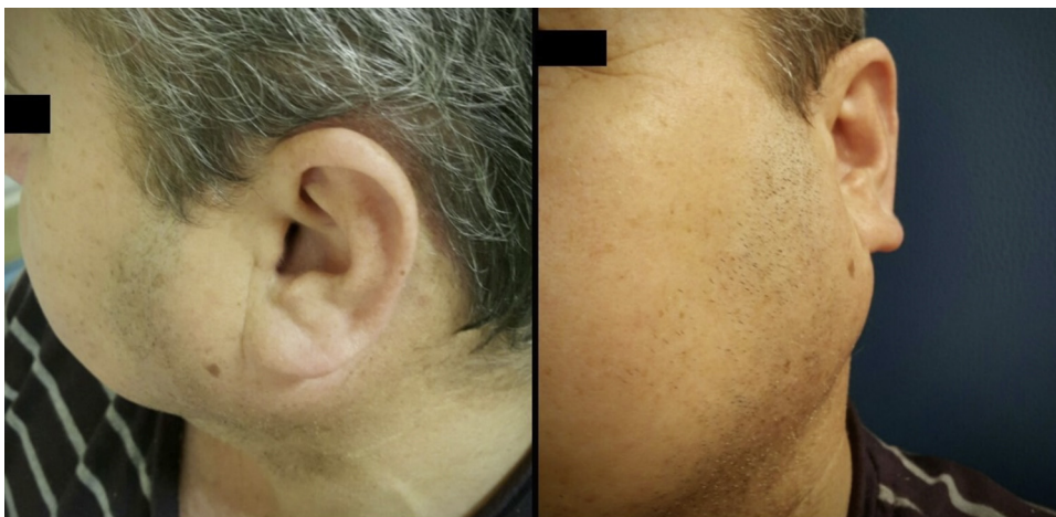
Figure 1 61-Year old patient with left parotid mass, on admission to the hospital.

patient underwent surgical treatment involving left subtotal parotidectomy. En bloc removal of the tumor was achieved with the excision of the superficial lobe. The facial nerve was preserved. Macroscopically, the mass was enveloped, solid and yellowish, with one cyst (1.5 cm in diameter) on the marginal part. Microscopically, the tumor mass included three different morphological patterns (Fig. 3). Pleomorphic adenoma was the dominant component. Within its tissue atypical cells of carcinoma ex pleomorphic adenoma were found. The marginal part of the solid mass included Warthin tumor cells. Surgical margins were free from neoplasm.