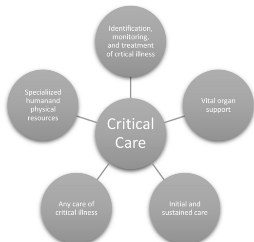
Figure 3 The defining attributes of critical care.

or Medical Emergency Teams have been introduced into some hospitals, often consisting of staff from the ICU responding to calls from the wards when a critically ill patient has been identified, and providing either critical care on the ward, or transferring the patient to the ICU. 24