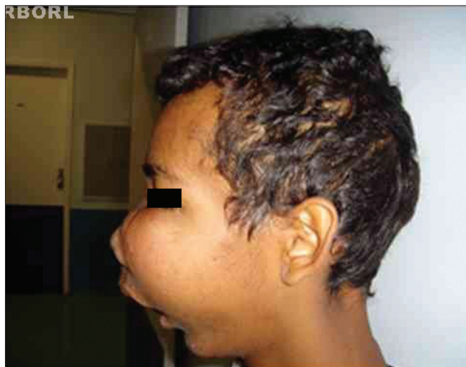
Figure 1. Recurrence of maxilla ameloblastoma.

The mandible was the most affected site. Nineteen (47.5%) patients had tumors restricted to the mandible body. Of these, five (12.5%) went beyond the mid-line. Eight (20%) had involvement of the mandible body and angle or angle and ramus; in 10 (25%) cases the lesion advanced to the body, angle, ramus and condyle; and three cases (7.5%) involved the maxilla - a less frequent location (Figure 1).