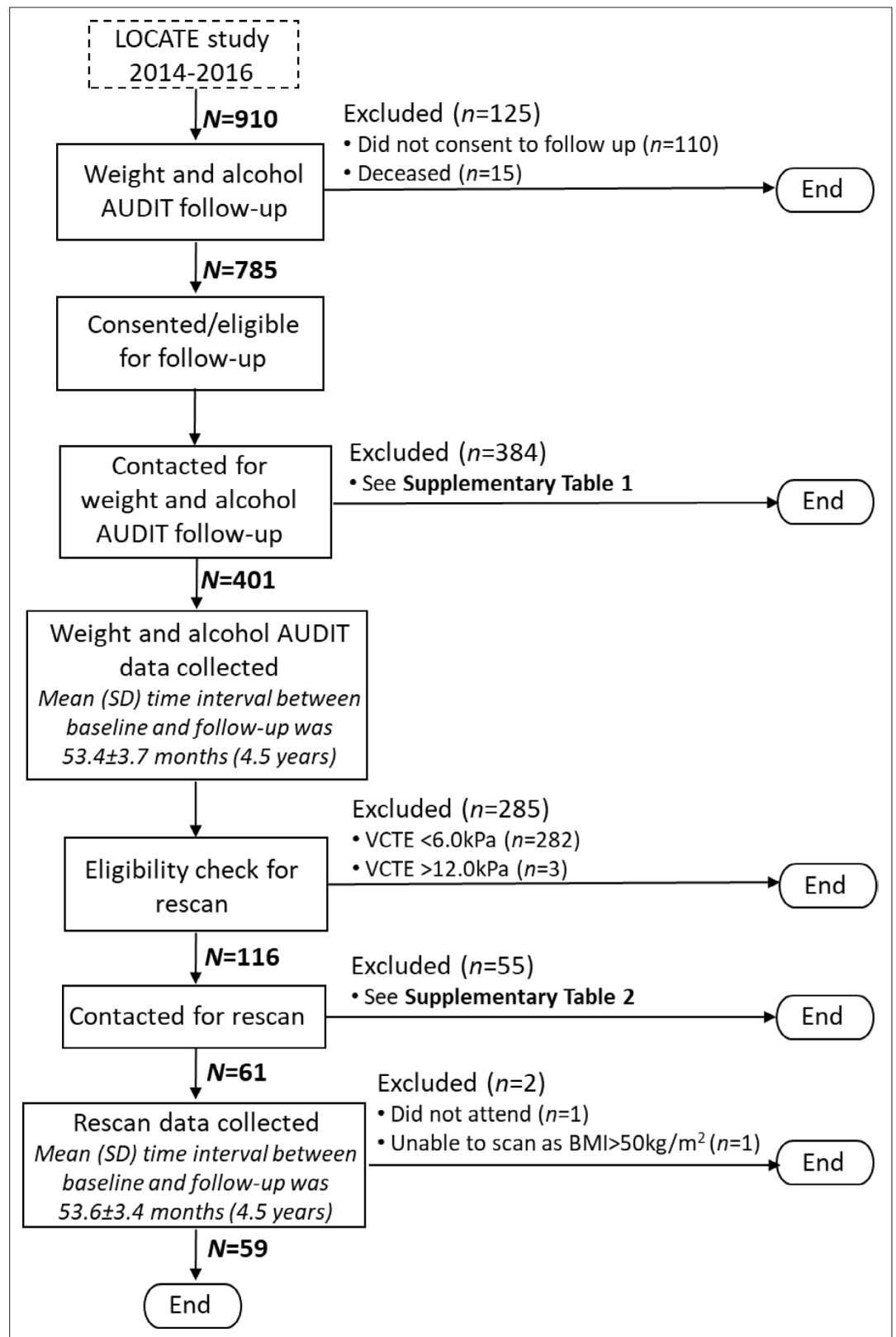
Figure 1 Flow of participants through the LOCATE follow-up study. AUDIT = Alcohol Use Disorders Identification Test. BMI = body mass index. VCTE = vibration-controlled transient elastography.