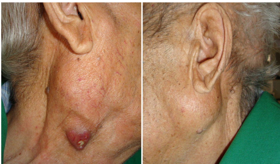
Figure 1 Bilateral swelling of the parotid glands. The right parotid gland shows a small, painless ulcer with continuous pus discharge.