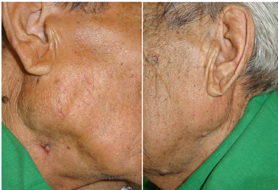
Figure 3 Pictures obtained after treatment was completed (10 month). The parotid gland swelling reduced on both sides and the ulcerative lesion on the right side healed.

technique to differentiate both types of pathologies. Histological and microbiological tests must be run on the tissue sample. Histology testing often shows granulomatous inflammation, while the microbiological diagnosis could be achieved by acid-fast bacilli staining, mycobacterial culture or PCR-based assays. Unfortunately, cultures result negative in 40.9% 3 of cases, due to the control of bacillary replication by an immunocompetent host against an attenuated mycobacteria strain. A CT scan may be a helpful tool in achieving the complete diagnosis as it helps determine the extension of the disease and it is used in the follow-up to evaluate the response to the treatment. 2