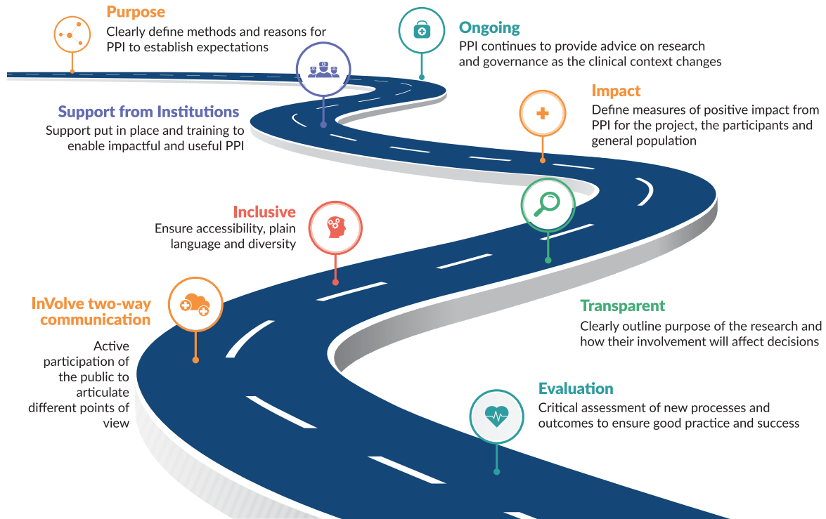
Figure 2 Patient and public engagement to improve clinical research. POSITIVE steps leading to co-creation with patients and the public, and better research using big data sources. Content adapted from the Consensus Statement on Public Involvement and Engagement with Data-Intensive Health Research 36 as used in the DaRe2THINK trial programme. 27 Adapted from Bunting et al. 37 PPI=patient and public involvement.

governmental, and healthcare agencies, as well as clinicians and patients in every medical specialty. The CODE-EHR checklist asks for clarity on reporting and defines a set of minimum and preferred standards on the processes that underpin coding, dataset construction and linkage, disease and outcome definitions, analysis, and research governance. Iterative updates to this framework are expected to enhance research quality and value and to generate new pathways for impact using routinely collected healthcare data.