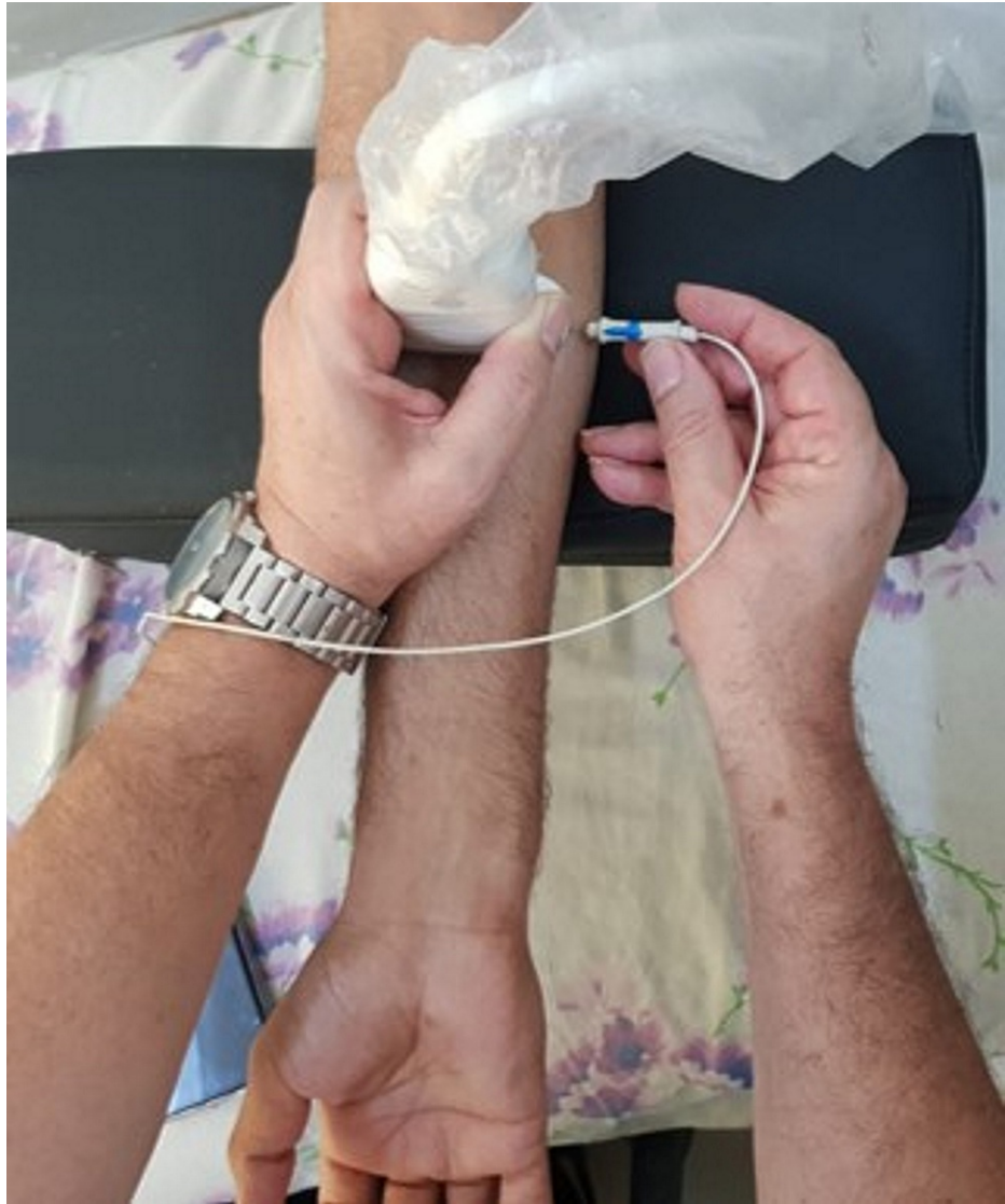
FIGURE 1: EMG needle insertion under US control.

The US probe is placed at the junction of the upper and middle thirds of the anterior side of the forearm. The EMG needle is inserted at the medial edge of the forearm and 2 cm away from the US probe. This needle should then follow a sloped path to the FCRM in the plane of the US section so as to be entirely viewed: this is called the US in-plane technique.