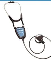
FIGURE 1: A timeline of the major improvements of the stethoscope.