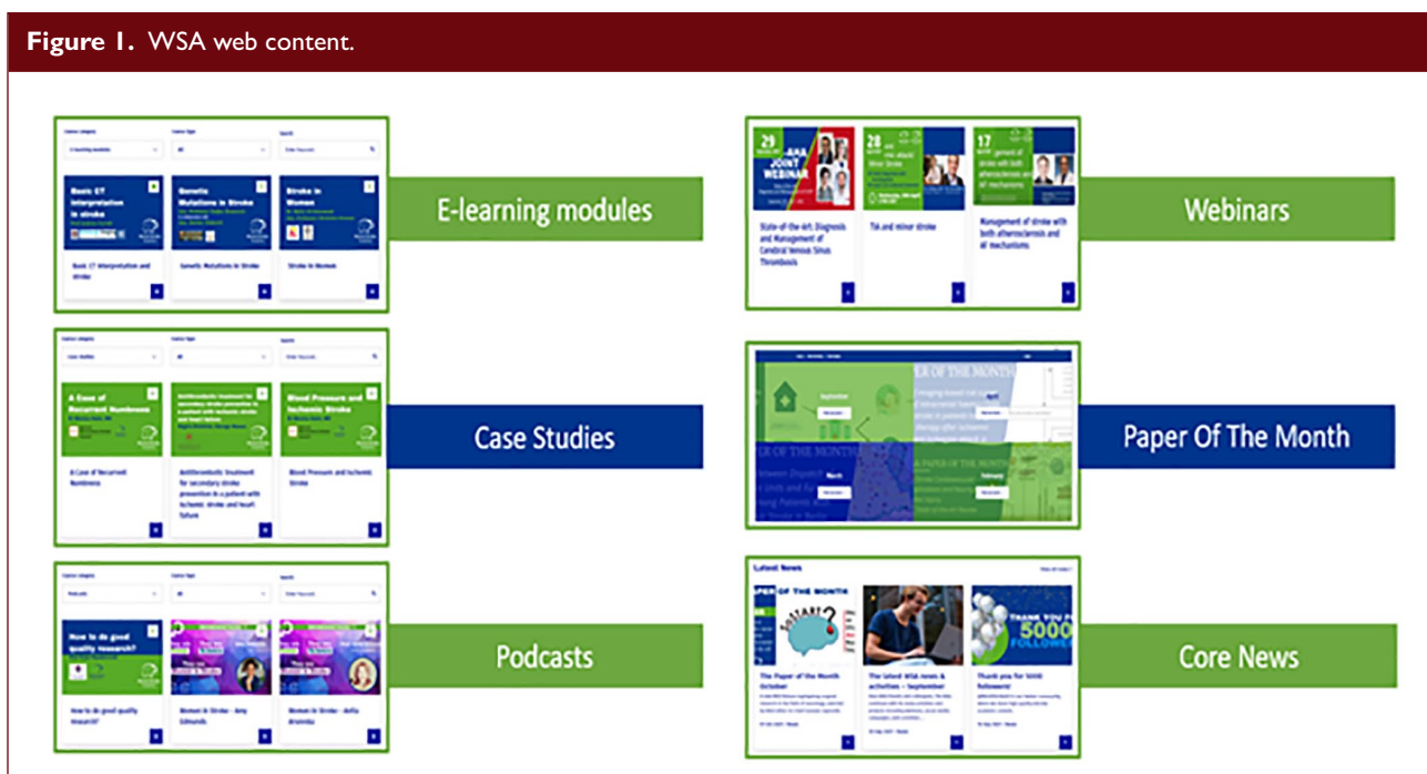
This figure describes all the educational content formats of the World Stroke Academy (links are in Table 2).

closely with global and regional policy makers to address key issues in health systems strengthening, prevention strategies and to improve access to healthcare. One of the ways that the WSO disseminates information on advances in stroke research and education and overcomes gaps in stroke care is through the use of the newly formed World Stroke Academy (WSA).