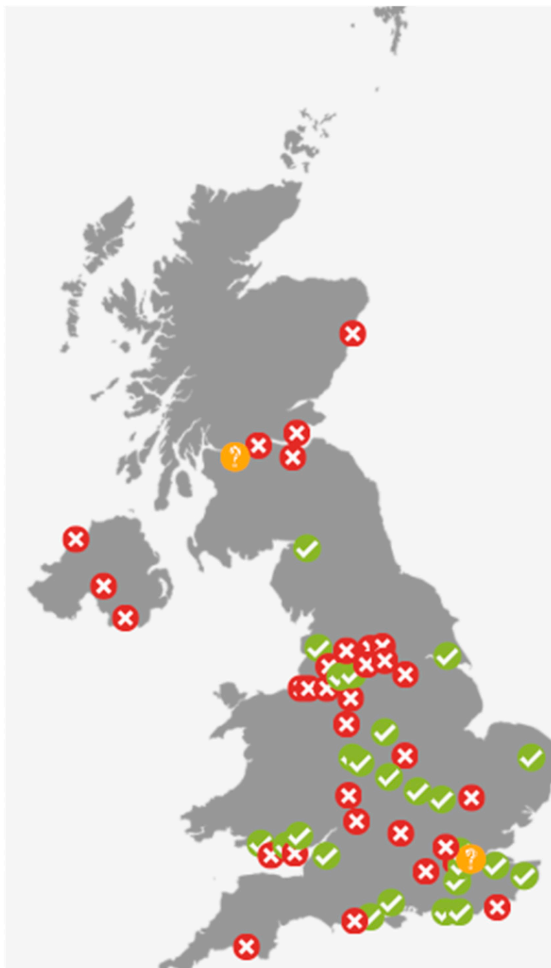
Figure 1. Overview of access to supervised exercise programmes (tick = access, cross = no access and question mark = don't know).