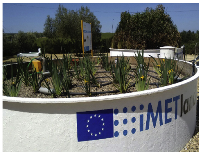
Fig. 3. METland® unit (20m 2 ) for treating wastewater from 50pe at Carrion de los Céspedes wastewater treatment plant (Spain).

Constructed wetlands are now well established for wastewater treatment. The so-called METland® (Fig. 3) is a MET-based application that integrates the use of electro-conductive granular material in constructed wetlands to effectively perform bioremediation in diverse contexts. Originally, METland® was designed to operate under flooded conditions and short-circuit modes as “snorkel” electrodes [67]. The natural redox gradient between the bottom of the system and the naturally oxygenated surface greatly enhanced microbial oxidative metabolism for removing organic pollutants [67]. The electron flow along the METland® bed was elegantly demonstrated by measuring the profile of electric potential along distances larger than 40 cm [68,69]. Full scale METland® units have been constructed with different electroconductive granular material like electroconductive coke [67] or more sustainable materials like electroconductive biochar (ec-biochar) obtained after wood pyrolysis at high temperature [70]. Although most of the MET-based applications are classically operated under anoxic conditions to avoid oxygen competition with anodic reactions, METland® has been recently proved to be effective even under down-flow aerated mode [71]. Electroactive bacteria from the genus Geobacter have been found to