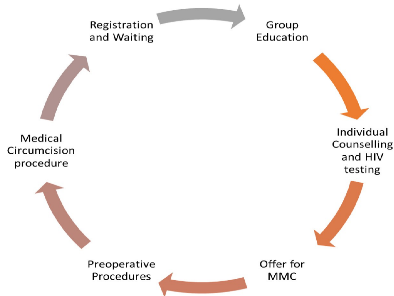
Fig 1. Patient flow for VMMC at site of operation.

https://doi.org/10.1371/journal.pone.0270545.g001