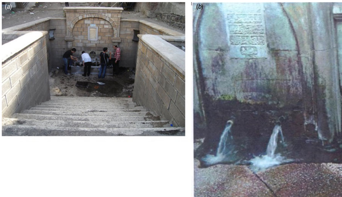
Fig. 1. Two examples of antique neighbourhood fountain implicated in this outbreak.