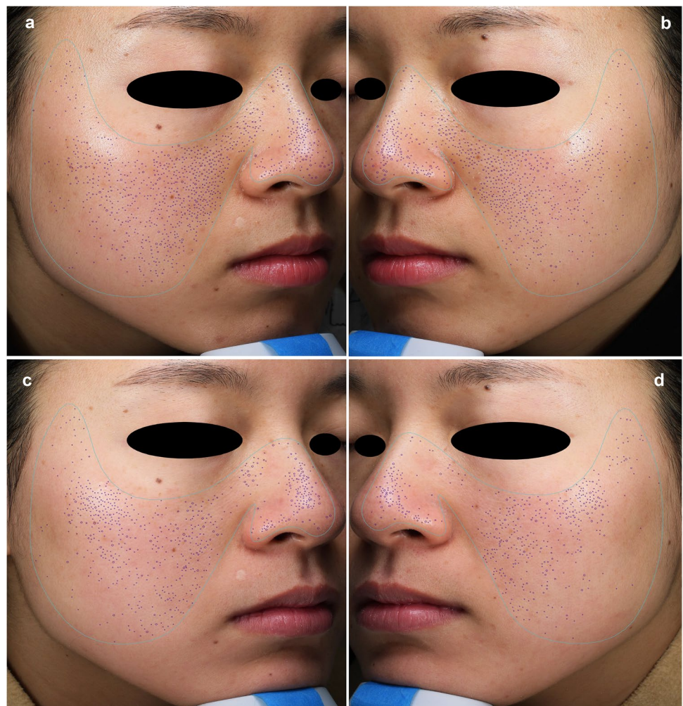
Fig. 2 Split-face comparison of pores of a 25-year-old woman at baseline and 2-month follow-up visit with the VISIA system, highlighting the pores available for counting. a LPNY-treated side at baseline. b NAFL-treated side at baseline. c LPNY-treated side at 2-month follow-up, pore number decreased by 28.9% compared to baseline. d NAFL-treated side at 2-month follow-up, pore number decreased by 43% compared to baseline. NAFL, 1565-nm non-ablative fractional laser; LPNY, long-pulsed 1064-nm Nd:YAG laser

The correlation between the appearance of the number of pores detected using VISIA analysis and the time of both treatment methods are illustrated in Fig. 1. The pore count was reduced after each treatment session for both types of lasers. Before treatment, the average number of pores was 1191 \pm 469.5 on the NAFL side and 1183.3 \pm 520 on the LPNY side. At the 2-month follow-up, these numbers significantly reduced to 852.1 \pm 372.5 and 920.5 \pm 392.7 ( p < 0.0001 and p < 0.0001 , respectively) (Fig. 2 and Fig. 3). On the NAFL side, the average pore reduction rate was 29%, whereas, on the LPNY side, it was 21.7%. We