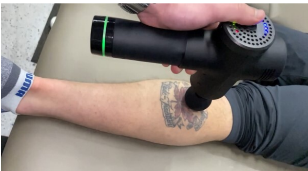
Figure 2. Hyperice Hypervolt+ being applied to the gastrocs to improve tissue extensibility

The author utilizes the Hyperice venom shoulder ( Figure 1 ) prior to treatment with patients following a rotator cuff repair. This helps to provide superficial heat for tissue extensibility combined with vibration for proposed benefits mentioned to improve range of motion in early and mid-phases of rehabilitation.