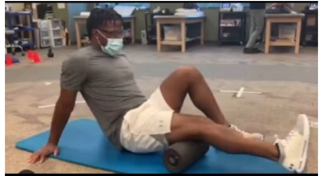
Figure 3. The Hyperice Vyper 2.0 vibrating foam roller being applied from popliteal fossa to Achilles to improve ROM and increase motor unit recruitment