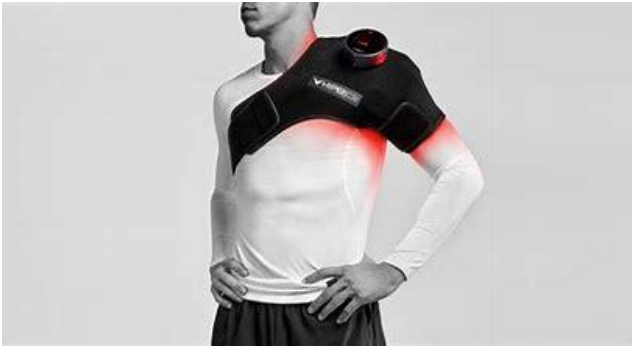
Figure 1. Hyperice Venom Shoulder unit providing pulsed or continuous vibration in conjunction with superficial heat to reduce pain and improve tissue mobility