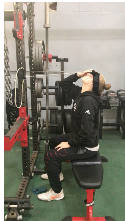
Figure 2. Example of cervical extension strengthening exercise using the Shingo Imara (Shingo Imara, Ann Arbor, Michigan)