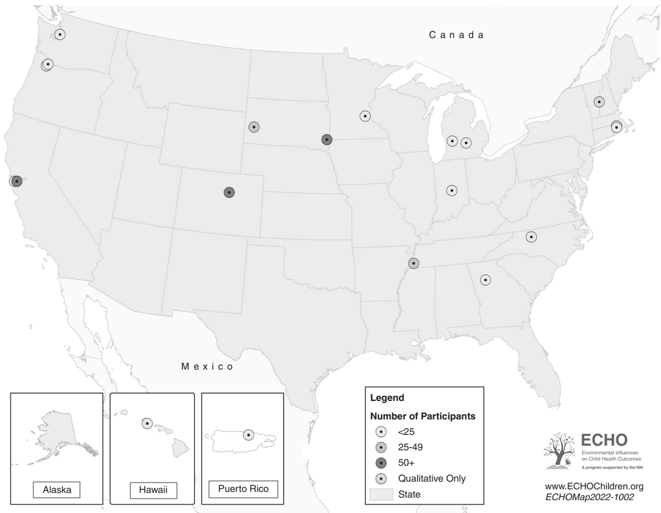
Fig. 2 Map of cohort recruitment sites. On this map are shown the sites where participants were recruited for this study. Different colors indicate the number of participants that each site contributed for the analyses: Yellow <25 participants; Green 25–49 participants; Blue \geq than 50 participants. In grey are shown sites that contributed only to the qualitative analyses.

Analyses for qualitative data. Qualitative data from all four sites was analyzed at the Colorado site. Each interview was recorded with the participant's permission. Audio recordings were transcribed verbatim and anonymized. Transcripts were uploaded to Atlas.ti software (version 9, Scientific Software Development GmbH, Berlin) for coding. Qualitative content analysis was used to systematically analyze and interpret interview transcripts. 29 This primarily inductive approach is common in the health sciences. Two members of the research team reviewed one transcript from each site to identify topics that appeared repeatedly (e.g., "remote schooling" or "bedtime routines"). Next, all transcripts were rigorously read and re-read to identify sub-categories (herein defined as codes) that appeared repeatedly. This process resulted in 28 distinct, inductively generated codes relevant for the present manuscript and a codebook in which each of the codes was assigned a definition, a sample quote, and exclusion criteria. Two members of the research team independently coded each transcript. After every three transcripts, the coders met as part