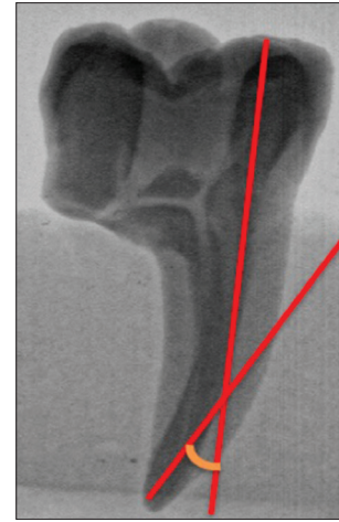
Figure 1: The lower first molar' mesiobuccal canal with a curvature angle of 27°, determined according to Schneider methodology

Round bur size # 3 followed by Endo-Z (Dentsply, Maillefer) was used to prepare the access opening cavities. By using