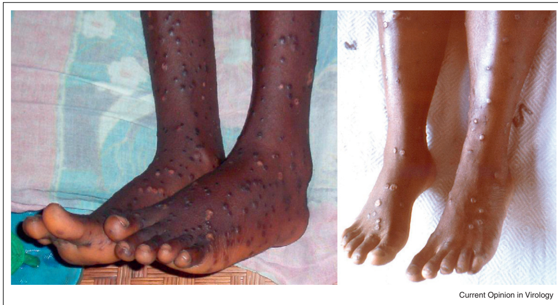
(a) Legs and feet of monkeypox patient. (b) Legs and feet of smallpox patient at similar stage of rash (pustular).

a sylvatic zoonosis and human infections are incidental and probably of little consequence to the overall persistence of the virus in nature. The current endemic distribution of monkeypox is in all likelihood governed by the distribution of its principal host(s). However, incidence of human infection is also dependent on cross protective immunity stemming from the vaccination campaign and previous exposure to variola or other Orthopoxviruses. Monkeypox virus is, however, capable of infecting a broad range of hosts, and spillover into a new permissive host with a more cosmopolitan distribution could — in theory — contribute to the virus' emerging as a threat to humans.