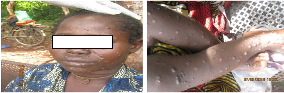
Fig. 3. Features of monkeypox skin rash in a woman and an infant living in Rehou 4 in 2016. Caractéristiques des éruptions du monkeypox chez une femme et un nourrisson habitant Rehou 4 en 2016.