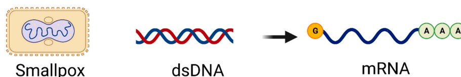
Fig. 1. Schematic illustration of monkeypox virion showing its unique structural arrangement and its transcription process.

As of May 2022, multination's geographically separated reported an outbreak of monkeypox cases affecting the United Kingdom (UK), and North America. 38 confirmed cases had been reported worldwide, and 37 cases had no history of travel to endemic countries. The UK Health Security Agency confirmed a familial cluster involving two cases of monkeypox in the UK on 14 May 2022. These occurrences have nothing to do with travel-related exposure to any individuals traveling from Nigeria. From the start of the outbreak to June 10th, the number of confirmed cases has increased and been reported as shown in Fig. 2 [29]. Most of the cases identified at the time of writing this review were reported in young people with same-sex sexual partners, and none of the cases had a recent travel history to the endemic area. The clinical manifestation of the infection appeared as lesions on the genitalia