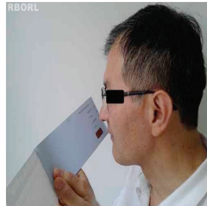
Figure 1 Male patient undergoing smell identification test (SIT) with booklet positioned at 1 cm from the nose.

was created by Doty et al. 7 in 1984 and recently adapted for the Brazilian population by Fornazieri et al. 8,9 This is an easy-to-use method with adequate reliability, suitable for outpatient use.