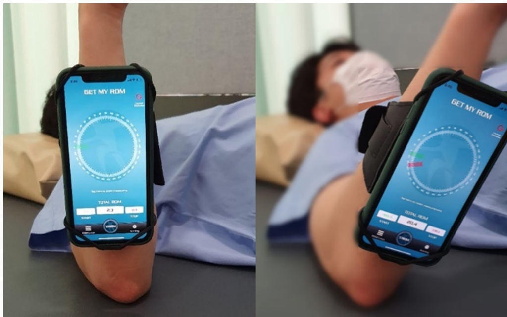
Figure 2 Measurement of the joint reposition angle error.