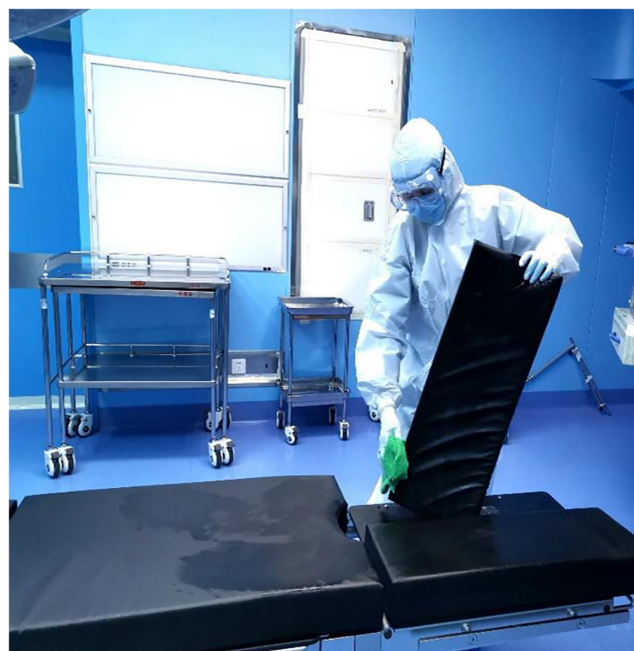
Figure 4. Personnel perform disinfection in the OR at Xijing Hospital, Air Force Medical University, Xi'an, China, during the coronavirus disease 2019 pandemic.

negative-pressure suction device to minimize the diffusion of aerosolized particles. When using any device that produced surgical smoke, a scrubbed team member used the second suction device to collect the smoke plume and reduce diffusion of aerosolized particulate matter as much as possible.