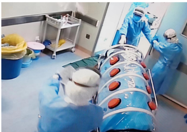
Figure 3. Perioperative personnel wearing required personal protective equipment use a transport cart equipped with negative pressure to transport a patient from the OR at Xijing Hospital, Air Force Medical University, Xi'an, China, during the coronavirus disease 2019 pandemic.

Personnel used two sets of negative-pressure suction devices during procedures. After transporting the patient to the OR, the anesthesia professional placed a mask over the patient's face and connected it to a