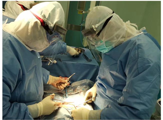
Figure 1. Scrubbed team members wearing required personal protective equipment perform surgery in the OR at Xijing Hospital, Air Force Medical University, Xi'an, China, during the coronavirus disease 2019 pandemic.

Perioperative staff members collected preoperative COVID-19 test results and verified that patients underwent all the necessary preoperative examinations. The pandemic response team members conducted preoperative surgical risk assessments, evaluated the risk of occupational exposure for personnel, and determined the level