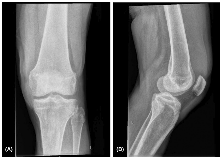
FIGURE 1 X-ray of the left knee: anterior-posterior (A), lateral (B) views

An evaluation of these findings led us to the conclusion that there had been significant reactive changes in the knee joint, followed by regression.