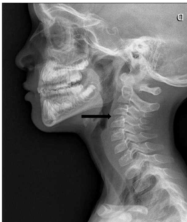
Figure 1 Initial lateral cervical X-ray where a discrete C3–C4 dislocation was described.

A 6-and-a-half-year-old boy presented to the emergency department with neck pain after falling from a bouncy castle. Initially, a cervical X-ray was ordered where a C3–C4 retrolisthesis was described (Figure 1). The patient was discharged with a foam collar, ibuprofen, and a follow-up orthopaedic appointment and CT exam. The CT exam was performed three days later, revealing a 2mm C4–C5 anterolisthesis, an increased interspinous process space, but no fractures (Figure 2), therefore the previous X-ray's findings weren't confirmed. The following day an MRI revealed C5–C6 interspinous ligament oedema, suggestive of a sprain, and superficial posterior paraspinal muscle oedema around C2 (Figures 3–4). An orthopaedic surgeon prescribed physiotherapy and saw the patient