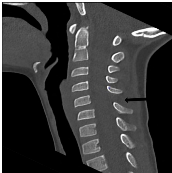
Figure 2 Follow-up CT exam revealing C4–C5 anterolisthesis and an increase in the corresponding interspinous space.