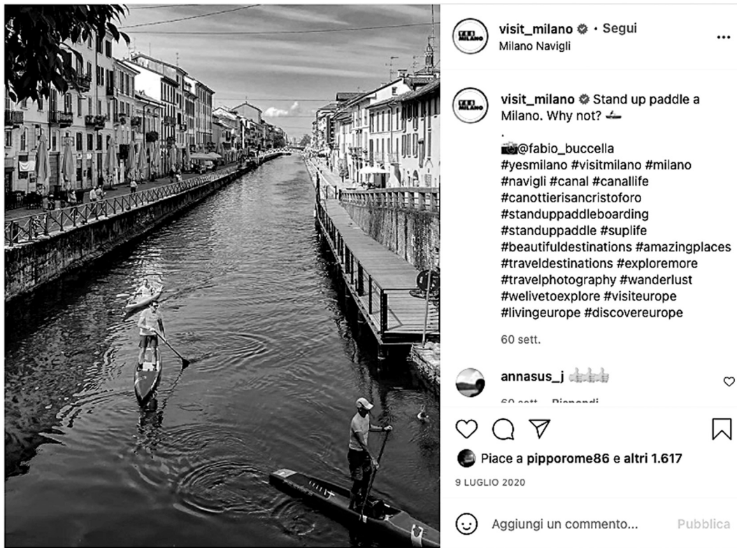
Fig. 1. An example of the collected posts.