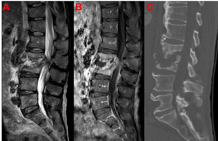
FIGURE 1: (A) Midsagittal T2-weighted MRI without contrast. (B) Midsagittal T1-weighted MRI with contrast. (C) Midsagittal CT scan without contrast. Imaging prior to initial intervention showing L2 and L3 discitis-osteomyelitis with intradiscal abscess causing cord compression.

Preoperative lumbar CT revealed endplate erosion and partial vertebral body collapse at L2 and L3 with severe spinal canal stenosis. MRI of the same area confirmed the presence of discitis-osteomyelitis at L2 and L3 with intradiscal abscess and posterior epidural phlegmon causing thecal sac compression. Intramuscular abscess formation was present in the bilateral psoas and iliacus muscles at the L2 and L3 levels (Figure 1A-1C).