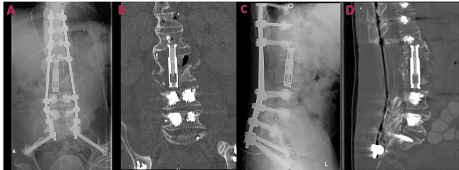
FIGURE 2: Postoperative films: (A) anteroposterior projection X-ray, (B) coronal CT scan, (C) lateral projection X-ray, and (D) sagittal CT scan.

Note that the inferior surface of the graft does not contact the superior L4 endplate and the top of the graft has subsided into the L1 body.