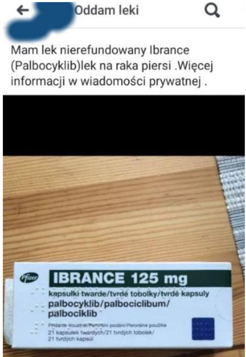
Fig 3. The example of the illegal online trade of medicines. Offer for palbociclib (Ibrance ® ). The URL address was not collected and is not reported to avoid the possible traceability of the Facebook user and to not to contravene the data protection or the GDPR. The presented figure is similar but not identical (partial screenshot with concealed parts of the picture) to the original image and is therefore only for illustrative purposes.

https://doi.org/10.1371/journal.pone.0275272.g003