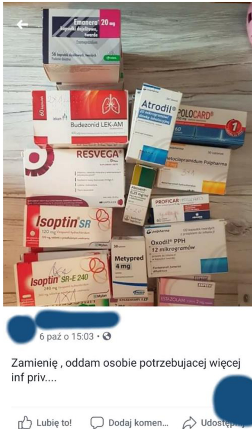
Fig 2. The example of the illegal online trade of medicines. Offer for estazolam (Estazolam ® ). The URL address was not collected and is not reported to avoid the possible traceability of the Facebook user and to not to contravene the data protection or the GDPR. The presented figure is similar but not identical (partial screenshot with concealed parts of the picture) to the original image and is therefore only for illustrative purposes.

https://doi.org/10.1371/journal.pone.0275272.g002