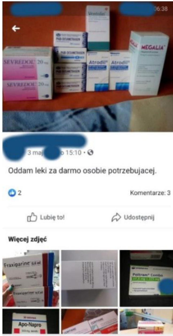
Fig 1. The example of the illegal online trade of medicines. Offer including morphine (Sevredol ® ) and tramadol (Polram Combo ® ). The URL address was not collected and is not reported to avoid the possible traceability of the Facebook user and to not to contravene the data protection or the GDPR. The presented figure is similar but not identical (partial screenshot with concealed parts of the picture) to the original image and is therefore only for illustrative purposes.

https://doi.org/10.1371/journal.pone.0275272.g001