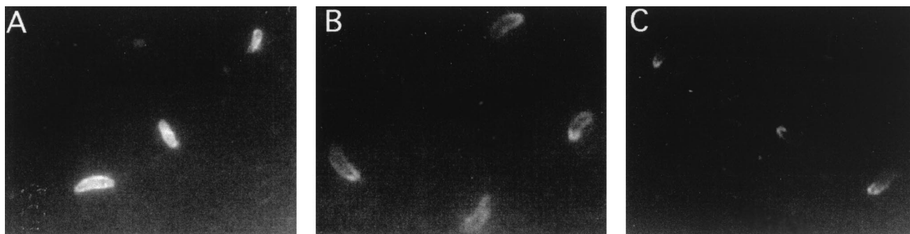
FIG. 1. IFA testing of human sera for reactivity against N. caninum . Slides were prepared with N. caninum tachyzoites as described in the text and treated with a 1:100 dilution of human sera. (A) Positive reactivity showing uniform peripheral staining of tachyzoites; (B) positive reactivity showing enhanced apical staining in addition to uniform peripheral staining of tachyzoites; (C) negative reactivity showing strong apical staining but no peripheral staining of tachyzoites.

well was tested with T. gondii -positive control serum. Monkey immune serum had a titer of 1:3,200 to N. caninum by this procedure and did not react with T. gondii .