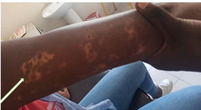
Fig. 2. Vitiligo lesion on patient's right.

vitiligo lesions in his nineteen years. For this, the diagnosis of Parry Romberg disease was retained. This condition is a clinical phenomenon initially described in 1825 by Dr. Parry [2] and then in 1846 by Dr.