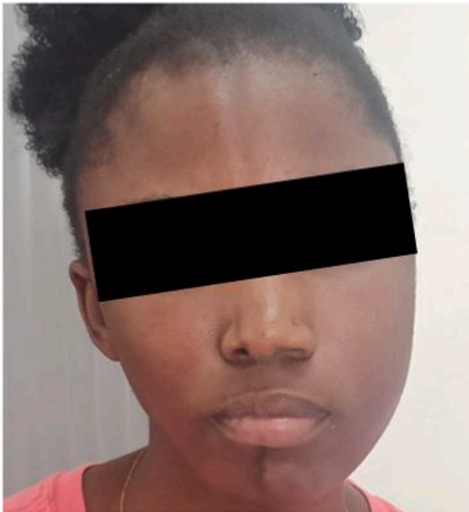
Fig. 1. A frontal saber-shape appearance and atrophy of the right.