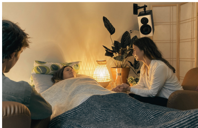
Figure 1 Mock-up of a dosing session in the test facility at neurobiology research unit, Rigshospitalet. Note: the individuals in the picture are not patients. Permission to use the picture in this publication has been obtained.

Each patient will be paired with two study personnel: a leading therapist and an assisting therapist. All therapists are mental health professionals (psychologists, MSc psychology students, medical doctors, MSc medical students and MSc music therapists) who have in depth knowledge of the psychopharmacology and mechanisms of action of psilocybin and have gained practical clinical