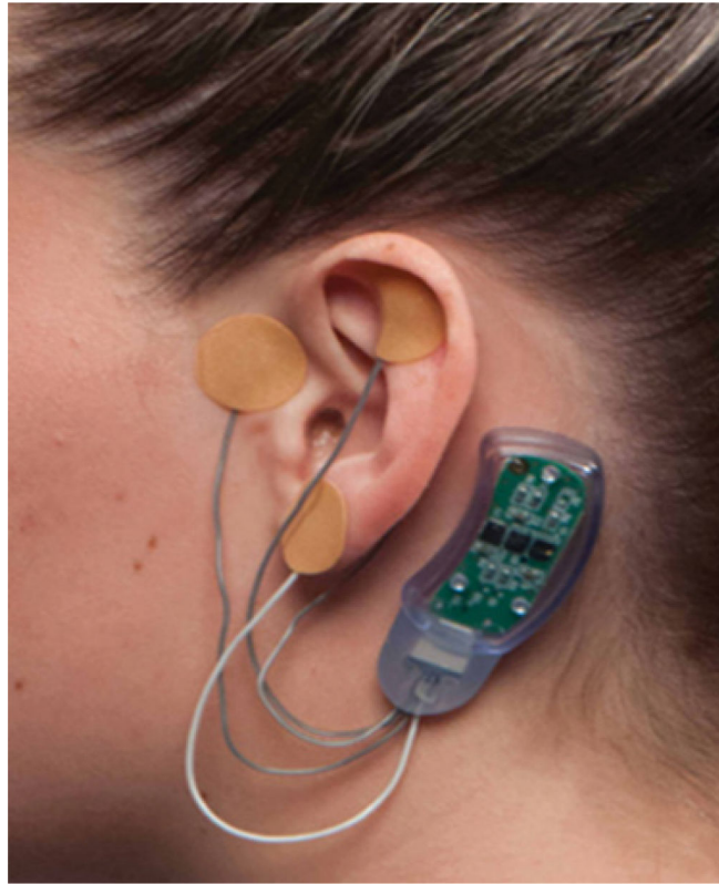
Figure 1: NSS2-Bridge Device.