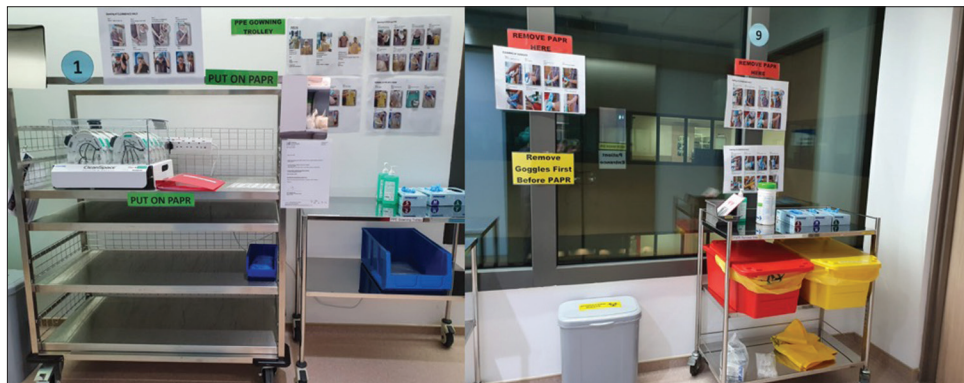
Figure 4: Photograph shows the donning and doffing stations with visual aids and mirrors.