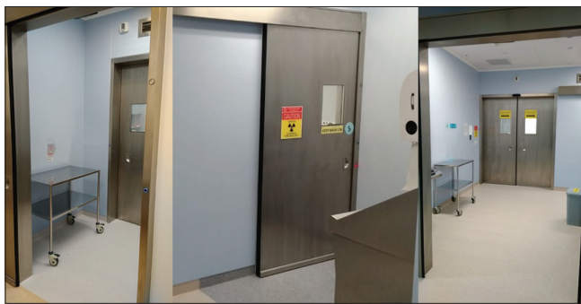
Figure 1: Photographs show the ante room, scrub room and induction room (from left to right).

The COVID-19 pandemic is evolving, and patient screening guidelines and criteria will keep changing. To simplify decision-making, the workflow to determine the criteria for use of the ISO3.4 is shown in Figure 3. Surgeries performed in the ISO3.4 include all positive COVID-19 cases, and emergency cases with symptoms that fulfilled the national Ministry of Health (MOH) criteria of suspected cases [MOH(+)] with swab results still pending. In the latter category, the emergencies could be urgent time-sensitive surgeries (e.g. limb salvage), or may involve very sick patients whose outcomes would be compromised if surgery is delayed till the swab test results are back. For cases that fulfil the criteria but the initial swab was negative, a repeat swab is performed, and if confirmed to be negative, surgery will proceed in the routine emergency OR.