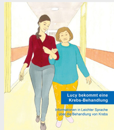
Buch zur Krebsbehandlung