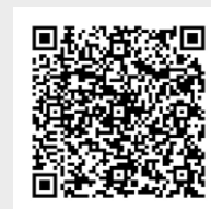
QR-Code scannen und online weiter lesen