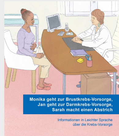
Buch zur Krebsvorsorge