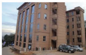
Infectious Diseases Institute, Makerere University College of Health Sciences