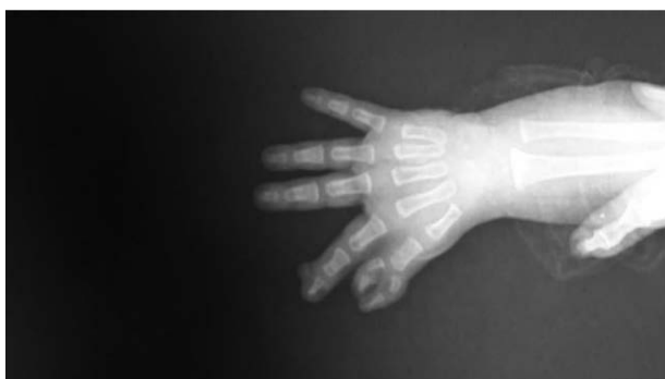
Figure 2. The picture X-rays of right hand that shows the deformities (triphala-ngeal thumb, thumb duplication and syndactyly).