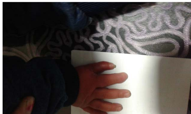
Figure 3. The picture of the right hand after following-up the patient that shows there is no any complication with improving the shape of hand's patient.