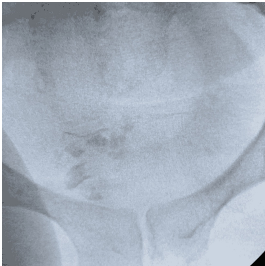
FIGURE 4: Intraoperative fluoroscopic image shortly after stent removal with residual stone fragments prior to irrigation