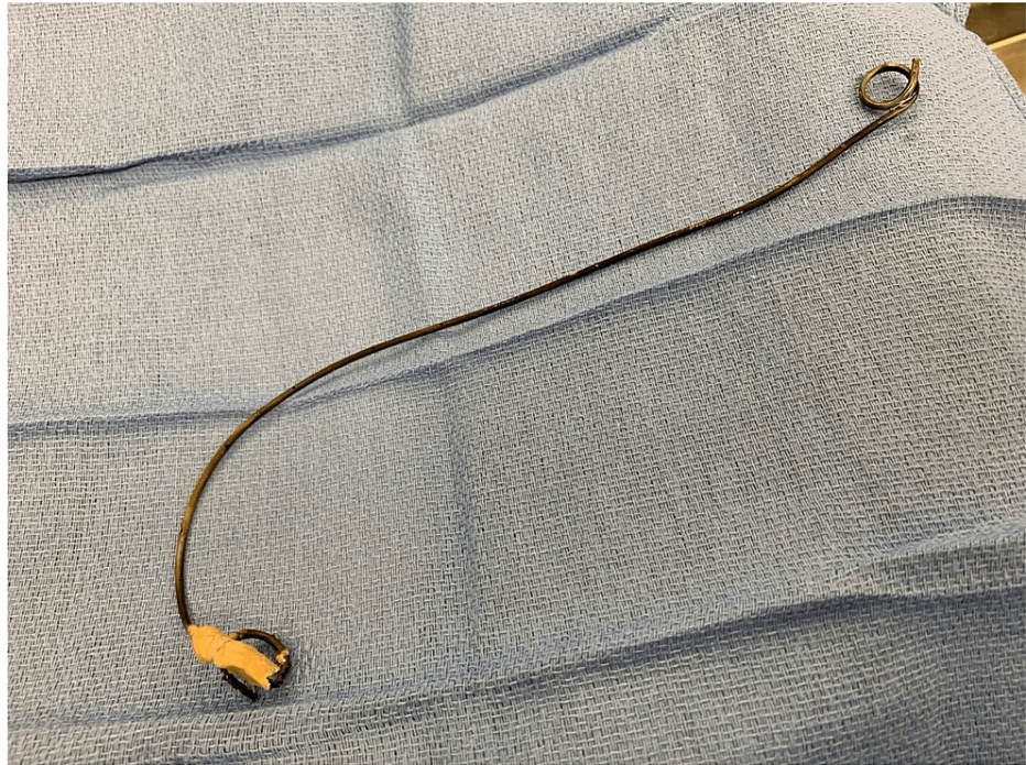
FIGURE 5: Postoperative image after successful extraction of the calcified ureteral stent

The remaining fragments of stone in the bladder were dusted using the Soltive laser, using an open tip catheter for further stabilization, with a pulse energy of 1.5J, frequency of 14Hz, and power of 21W, bringing us to a total laser time of 24.37 minutes. The final fluoroscopic view of the abdomen did not reveal any remaining calcifications in the bladder or overlying the left renal shadow. Cystoscopy confirmed there was no evidence of bladder perforation. Following the procedure, she reported marked improvement in the left flank pain with clear urine output. Upon discharge, her creatinine levels reverted to 1.15 from the initial presentation level of 1.58.