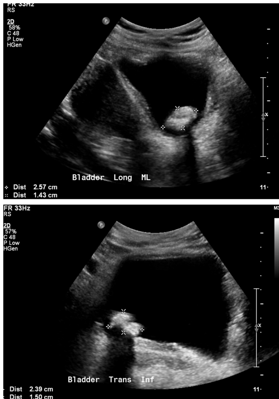
FIGURE 2: Pre-operative ultrasound further revealed the distally calcified ureteral stent in the urinary bladder

In the ED, the patient had a temperature of 98°F, a heart rate of 73 beats/minute, and blood pressure of 109/59 mmHg. Despite the patient being afebrile, her persistent left flank pain was highly concerning for possible pyelonephritis. On urinalysis, there was hematuria with positive nitrites and leukocytes. A complete blood count (CBC), urine culture, blood culture, and basic metabolic panel (BMP) were ordered upon admission. On CBC, there was a mild elevation in the absolute neutrophil count of 7.22 (reference range: (1.3 - 7.1) \times 10^9 ). Notably, on BMP, her creatinine level was 1.58. Urine culture revealed 50,000 CFU/mL mixed bacteria flora contamination, and blood cultures resulted in no growth. The patient was promptly started on IV Cefepime 2g q8H and IV fluids for infection control. Over the next few days, the patient's vital signs remained stable, and her symptoms gradually improved before proceeding with surgical intervention. Due to the feasibility of the procedure at our institution and the fact that it is less invasive than other alternatives, the patient underwent a combined, one-session approach with cystoscopy and lithotripsy utilizing a combination of Olympus ShockPulse and Soltive laser lithotripsy. We found the ShockPulse to be the most effective for the larger stones. The smaller stones were instead eradicated with the Soltive laser.