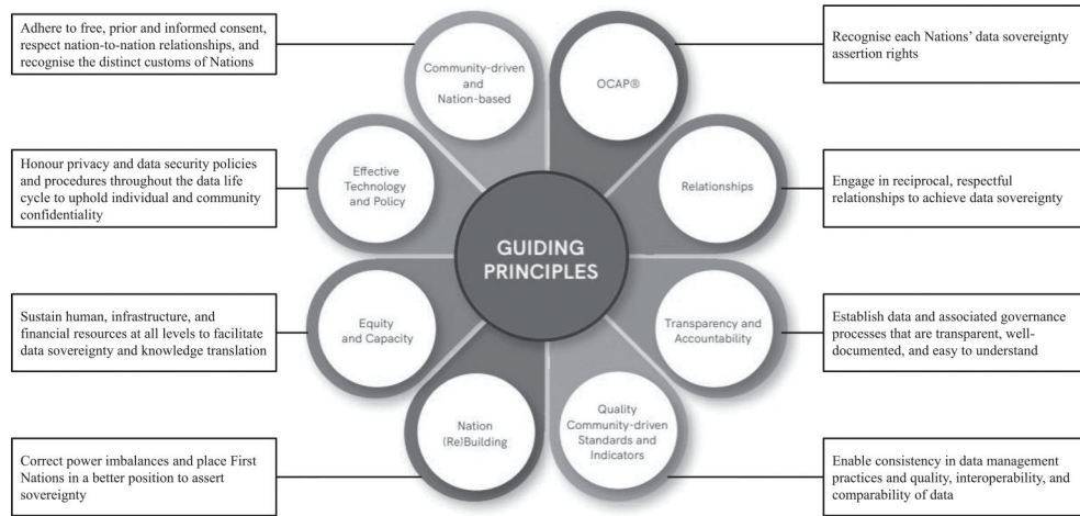
Figure 2. Guiding principles from FNIGC's First Nations data governance strategic framework.