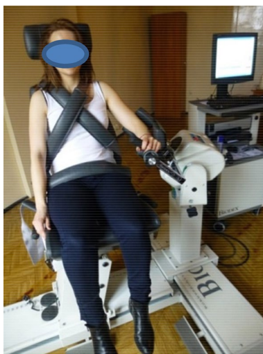
Fig. 1 Patient position during examination

For clinical evaluation we used the ASES (American Shoulder and Elbow Surgeons) score, created by the Society of the American Shoulder and Elbow Surgeons. The ASES score contains a physician-rated and patient-rated section. Pain, instability and daily living activities' assessment are included in the patient section. The physician-rated section contains range of motion, strength and instability evaluation as well as other clinical tests. The maximum number of points is 100 [18]. UCLA (University of California Los Angeles) score contains pain, strength, range of motion, function assessment as well as patient satisfaction. Points range from 2 to 35 in this scale [19].